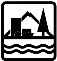
Department of Land Conservation and Development